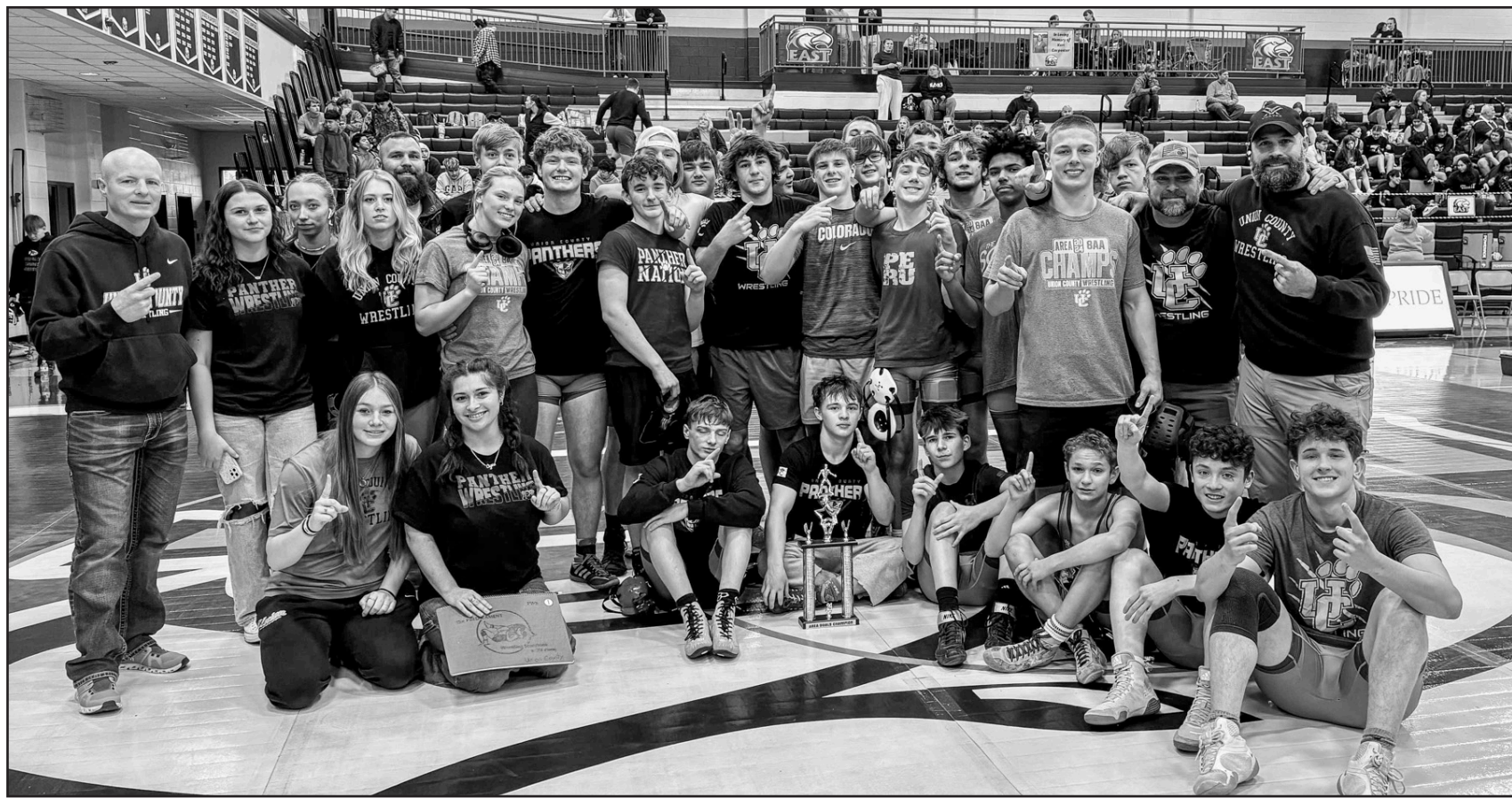
Union County came out on top at East Jackson's Area Duals tournament, defeating Stephens County, Franklin County and East Jackson.

The Individual Area Tournament begins on Jan. 31 at Stephens County. The Class AA State Sectionals are Feb. 7-8 at North Murray. The season concludes Feb. 13-15 in Macon with the Traditional State Championships.